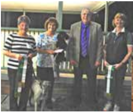
Rally O Novice