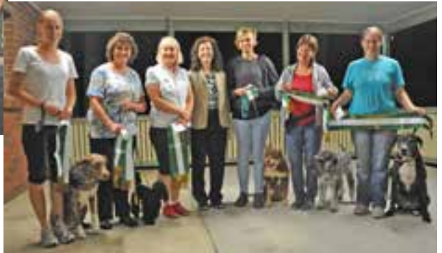
Rally O Advanced A & B