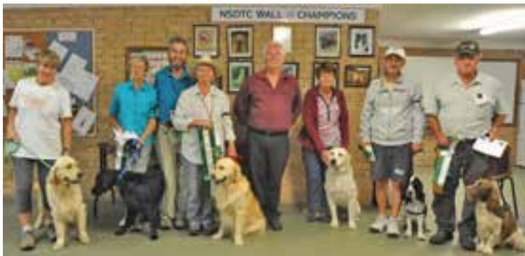
RATG Novice & Open