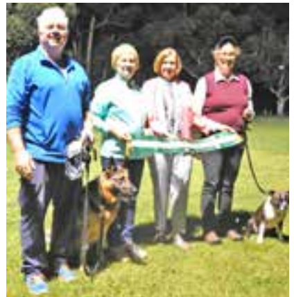
Rally O Master