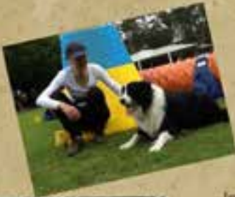
Introduction to Agility 2015 Northern Suburbs Dog Training Club