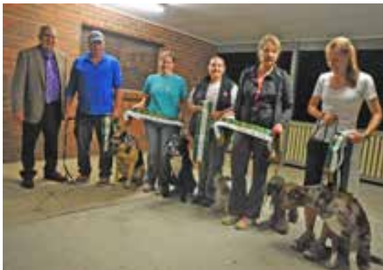
Rally O Excellent A & B